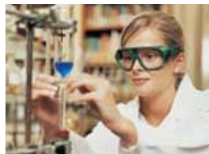
Support for the Cambridge AICE Diploma