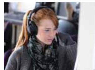
Cambridge AICE Diploma credits