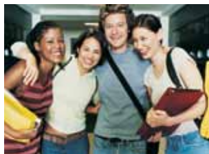
Key benefits of the Cambridge AICE Diploma

The Cambridge AICE Diploma was first examined in 1996 and has since become popular with a range of schools in different parts of the world. It encompasses the 'gold standard' Cambridge International AS and A Level qualifications, and offers students the opportunity to tailor their studies to their individual interests, abilities and future plans within an international curriculum framework.