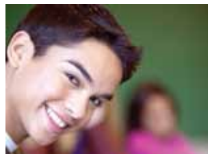
The Cambridge AICE Diploma curriculum