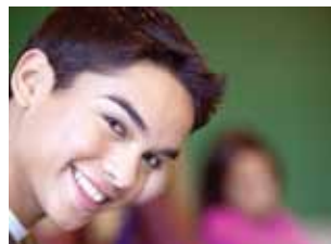
The Cambridge AICE Diploma curriculum