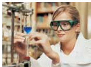
Support for the Cambridge AICE Diploma