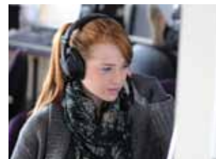
Cambridge AICE Diploma credits