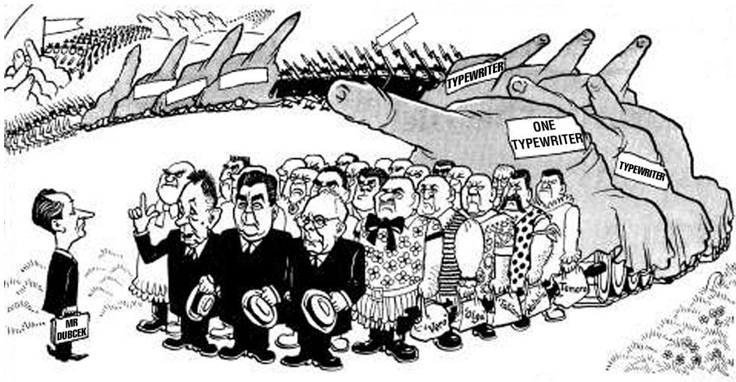
A British cartoon published on July 24 1968. The leading figures facing Dubcek are Kosygin and Brezhnev. They are saying to Dubcek 'Of course, Mr Dubcek, we've had to bring a few lady secretaries and some tea boys.'