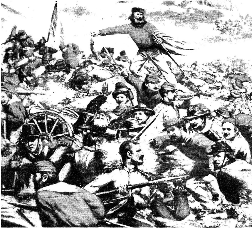
An illustration of Garibaldi in the battle of Calatafimi, published shortly after the battle in 1860.