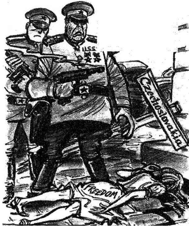
A cartoon published in the USA in September 1968. The soldier is saying 'She might have invaded Russia'.